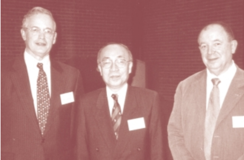
Left to Right: Harold T. Shapiro, NBAC Chair; Hiroo Imura, Chair of the Japanese Bioethics Commission; Jean-Pierre Changeux, Chair of the French national bioethics committee (CCNE), at the Second International Summit of National Bioethics Commissions in Tokyo, November 1998.

lectures, media interviews, and publications and editorials in the scholarly literature and the popular press.